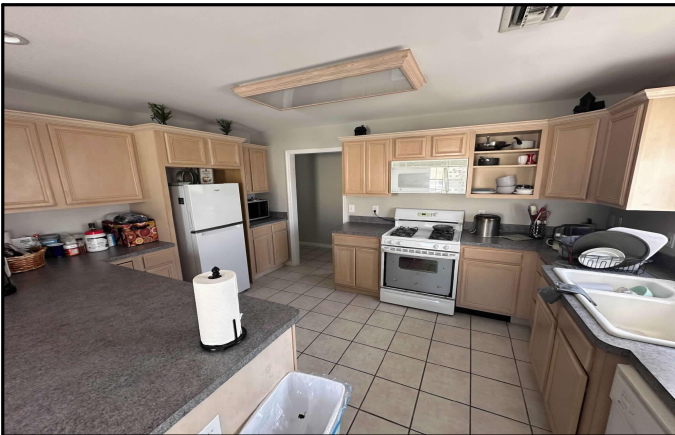
2ND FLOOR APARTMENT