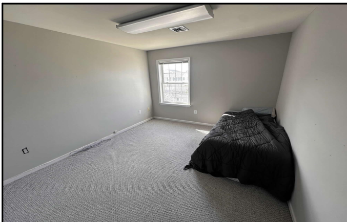
2ND FLOOR APARTMENT