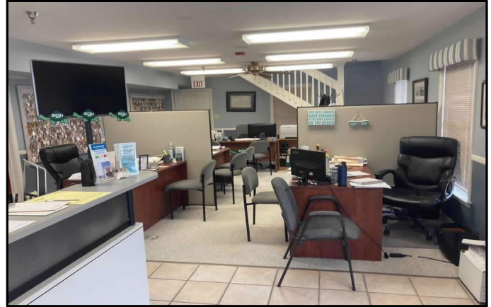
FIRST FLOOR OFFICE