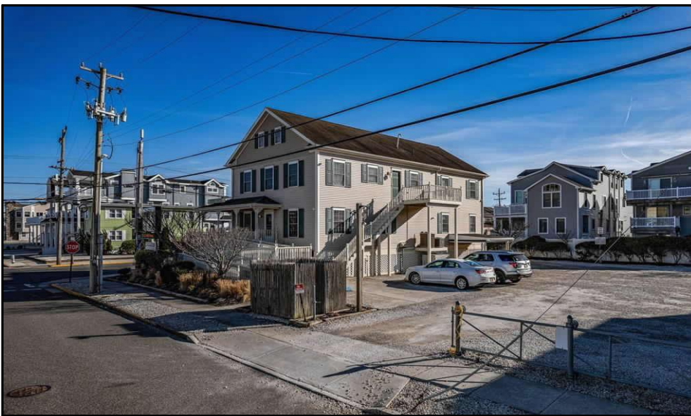
REAR VIEW OF SUBJECT PROPERTY