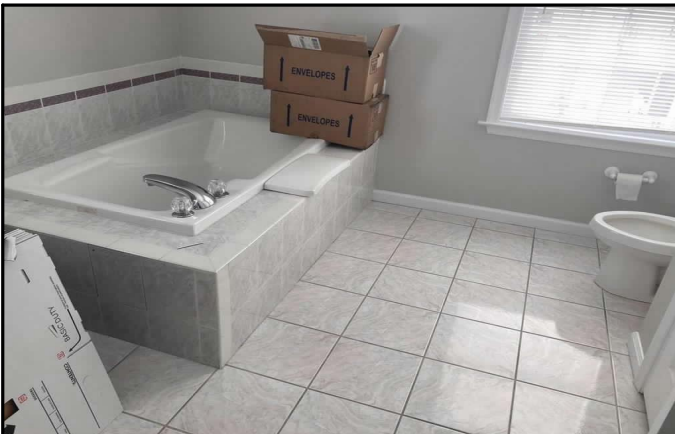
2ND FLOOR APARTMENT