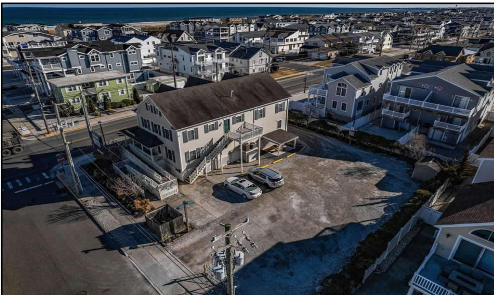
OVERVIEW OF SUBJECT PROPERTY