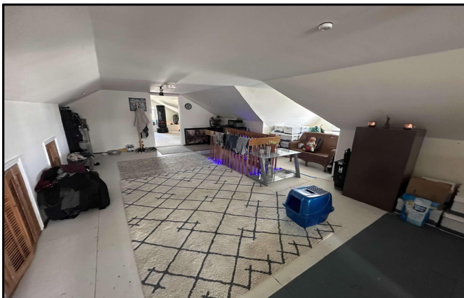
2ND FLOOR APARTMENT