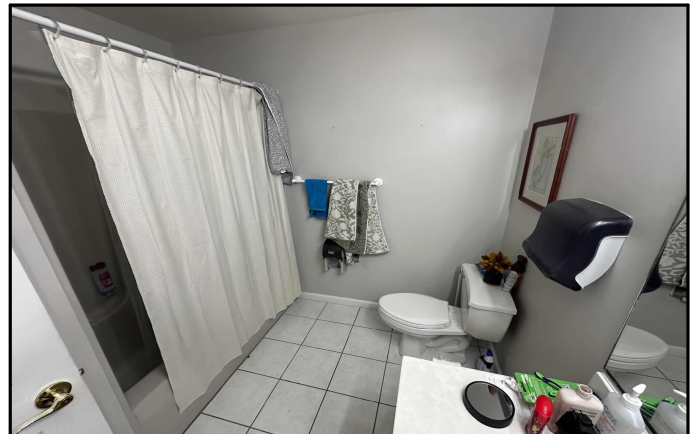
2ND FLOOR APARTMENT