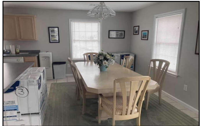
2ND FLOOR APARTMENT