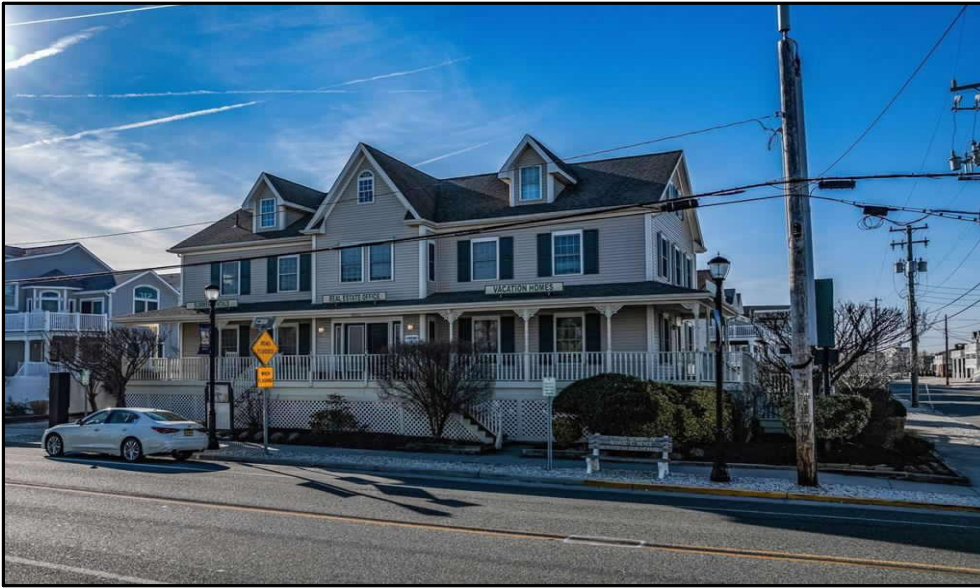
FRONT VIEW OF SUBJECT PROPERTY