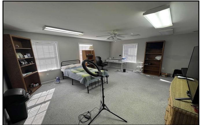
2ND FLOOR APARTMENT